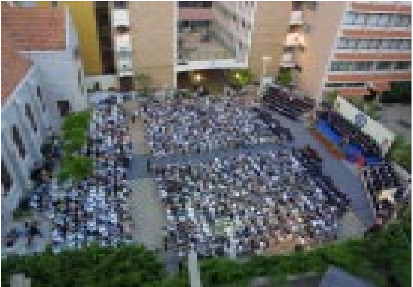
Haigazian University Commencement 2003 (See story on page 8)

Publication of the Armenian Missionary Association of America JULY/AUG/SEPT 2003 - Vol. XXXVI No. 3 (ISSN 1097-0924)