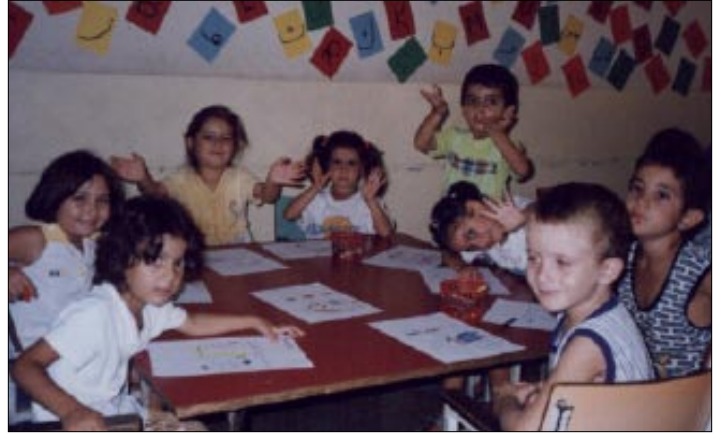
The Study Room.

Because of lack of an appropriate and affordable medical insur-