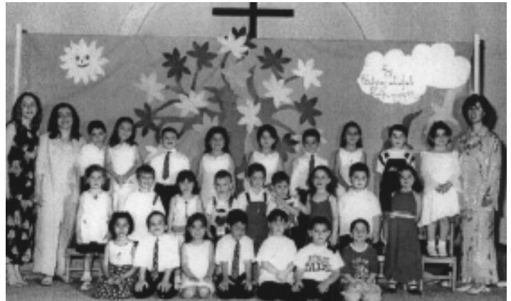
Վերապատուելիին օրհնութեան աղօթքով վերջ կը գտնէ հանդիսութիւնը:

Եկեղեցւոյ Տիկնաց Մարմնի կողմէ Պատկերագար Աստուածաշունչի 365 պատմութիւններով Աստուածաշունչ նուէր կը տրուին շրջանաւարտներուն, ինչպէս նաեւ ծաղիկեկողմներ պաշտօնէութեան: